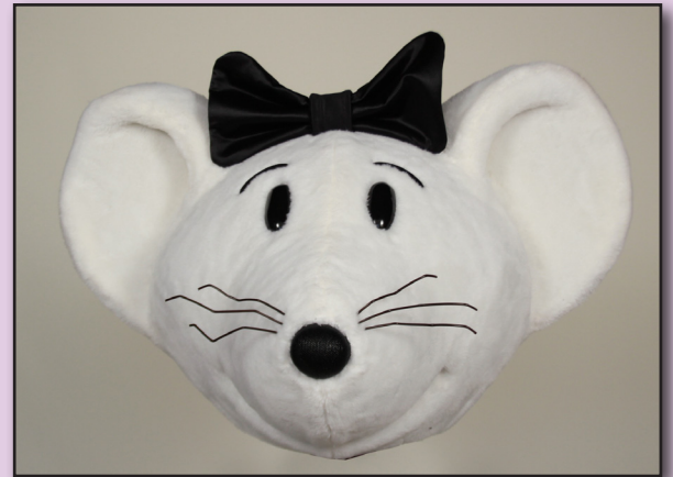
Head with Ears