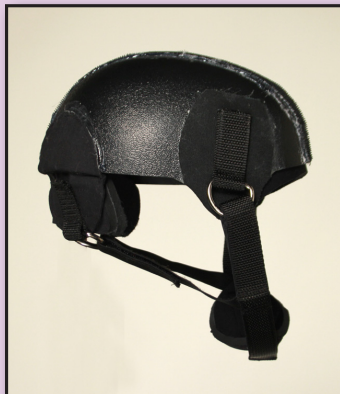
Headgear (inside Head)