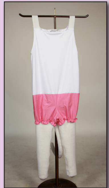
Jump Suit with tail