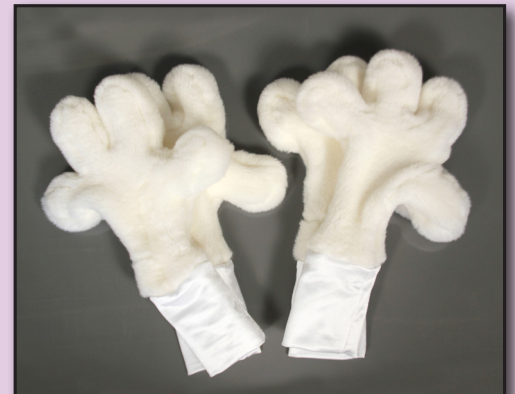
2 pair of Mitts