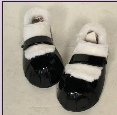
1 pr. Parade Shoes