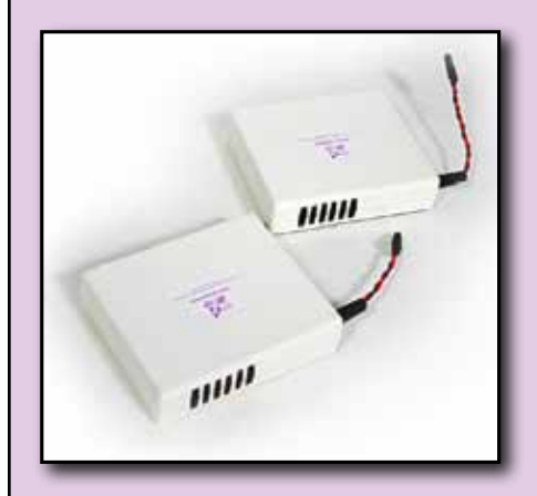
2 BSC Fans(located in the Body)