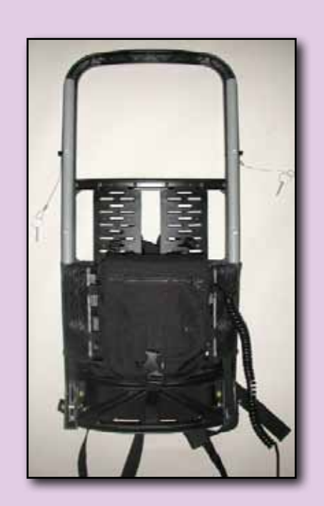
Backpack w/ V-Mount Bag