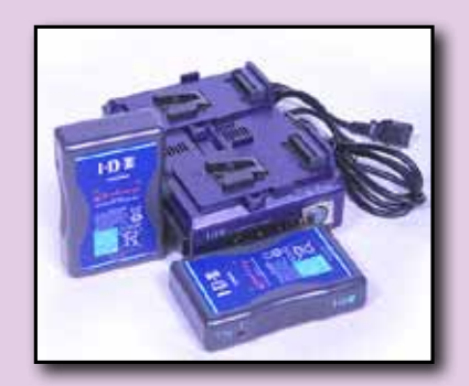
2 Endura Batteries and VL-2 Charger