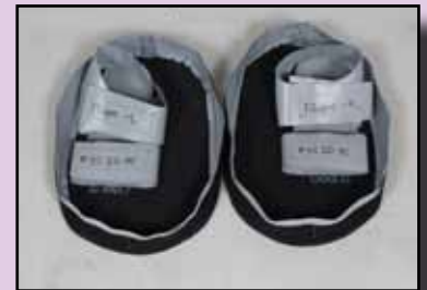
1 pr Shoe Bases