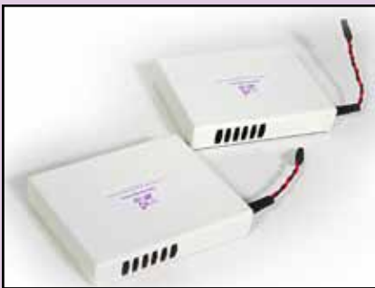
2 BSC Fans (located in the Body)