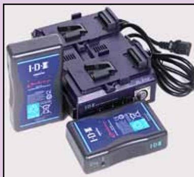
2 Endura Batteries and VL-2 Charger

1 Body Hoops Set of 3 Suspender Straps (located in Body)