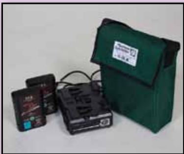
2 CUE D75 Batteries and VL-2 Charger