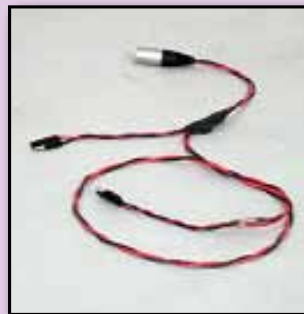
Y-Cable (located in Body)