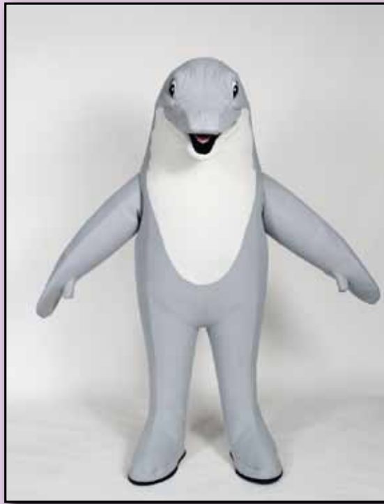
Body w/removable Eye's