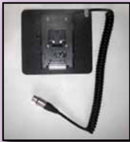
V-Mount Plate (located in the back of the Electrical Vest)