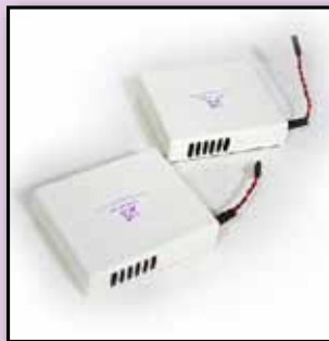
2 BSC Fans (located in the Body)