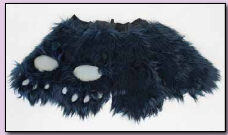
2 Pr. Mitts