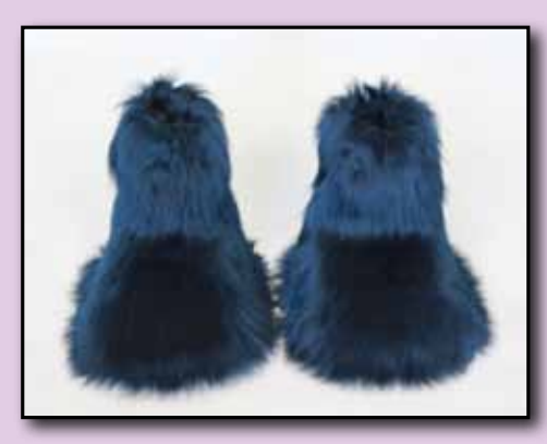
1 Pr. Parade Shoes