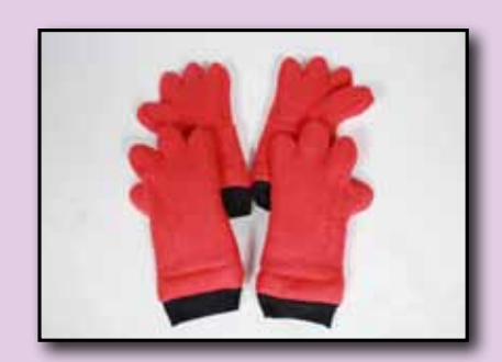
2 Pr. Mitts

Additional Parts not shown: 2 Shoe Bags Cleaning Instructions Shipping Trunk