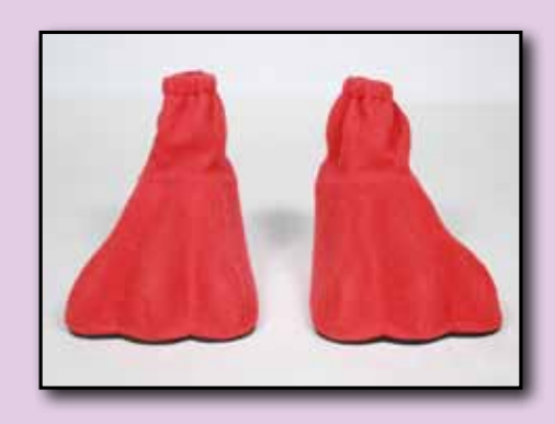
1 Pr. Parade Shoes