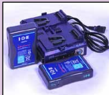
2 Endura Batteries and VL-2 Charger