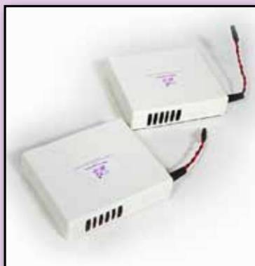
2 BSC Fans (located in the Body)