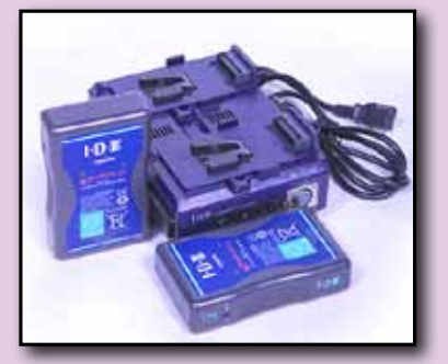
2 Endura Batteries and VL-2 Charger