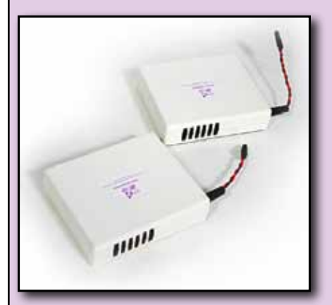
2 BSC Fans(located in the Body)