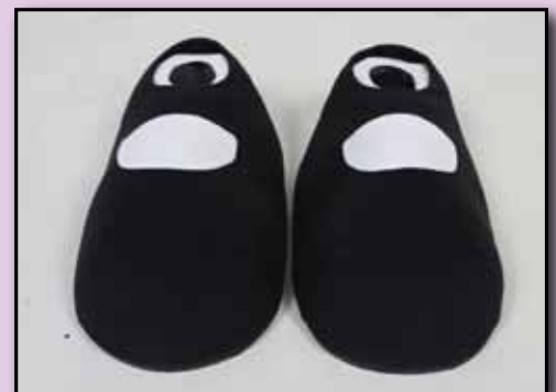
1 Pr. Parade Shoes