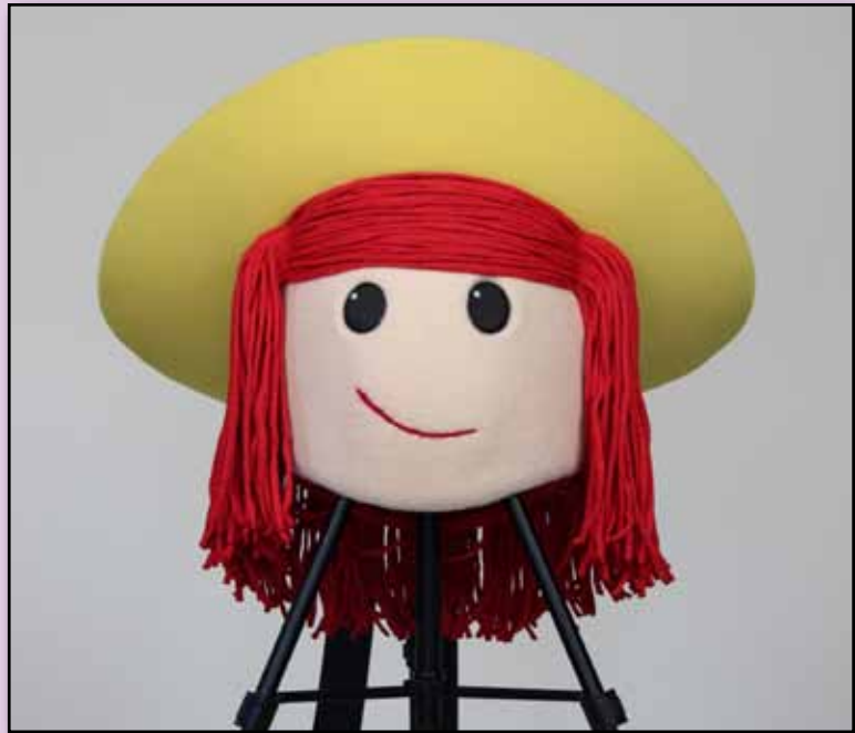
Head w/attached Hat