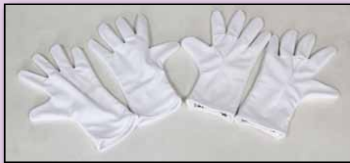
2 Pr. Mitts