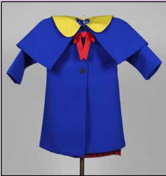
Coat w/attached Dress