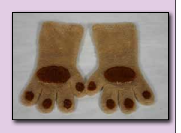
1 Pr. Mitts