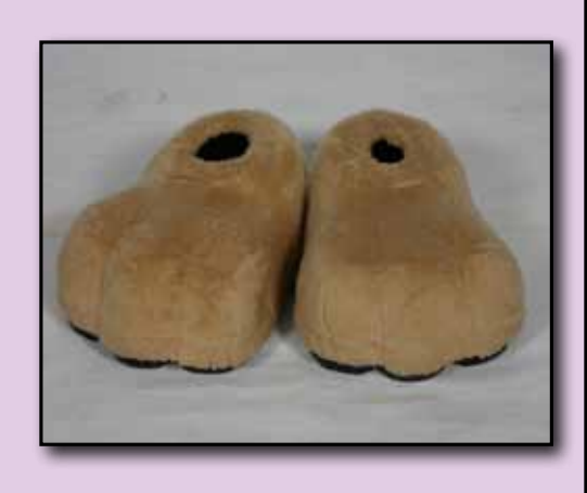
1 Pr. Parade Feet