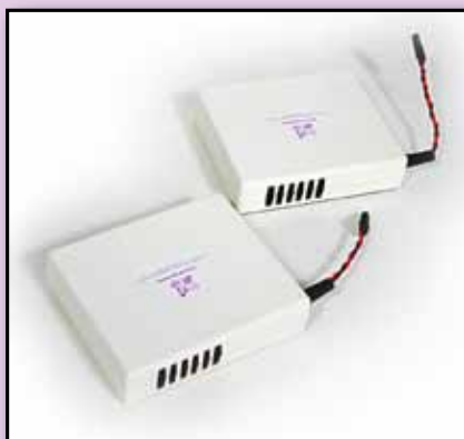
2 BSC Fans (located in the Body)