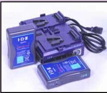
2 Endura Batteries and VL-2 Charger