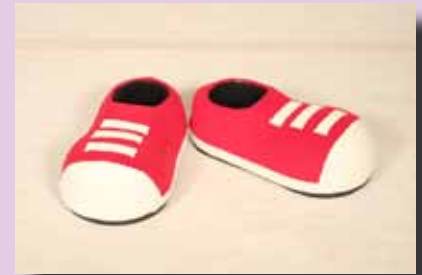
1 pr Shoe Bases