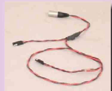
Y-Cable (located in Body)