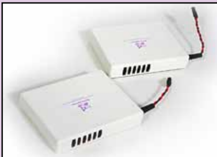
2 BSC Fans (located in the Body)