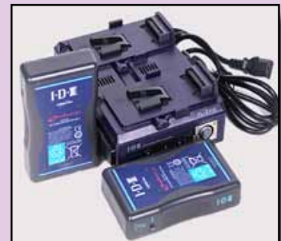
2 Endura Batteries and VL-2 Charger