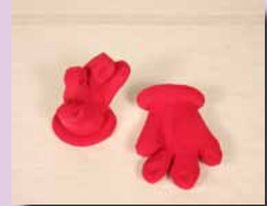
2 Pr. Mitts