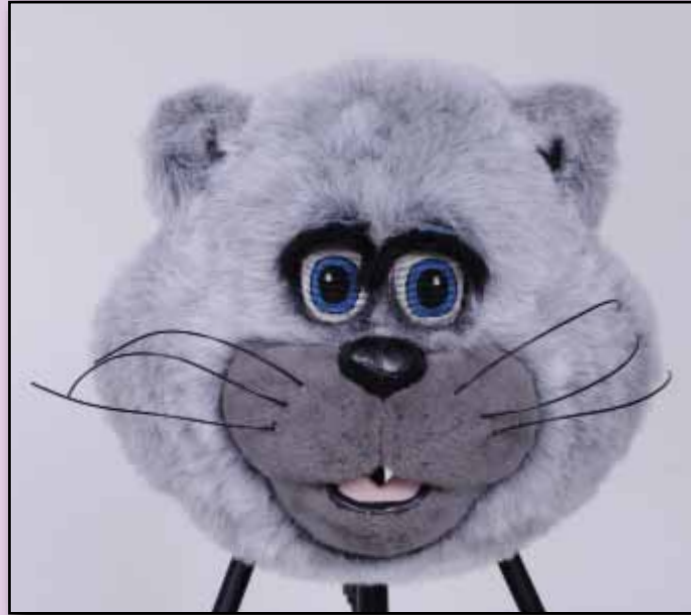
Grey Kitty's Head