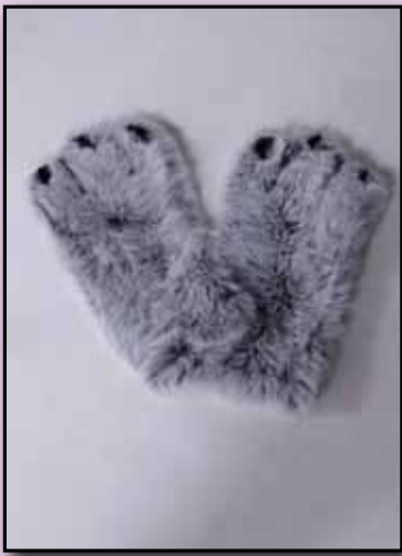
1 Pr. Mitts