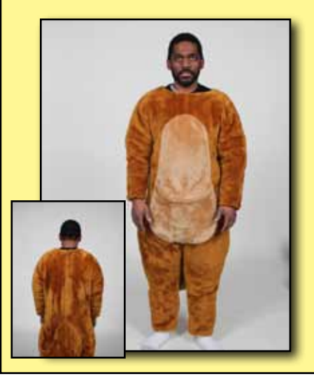
1 Put on the Body. Velcro closed in the back