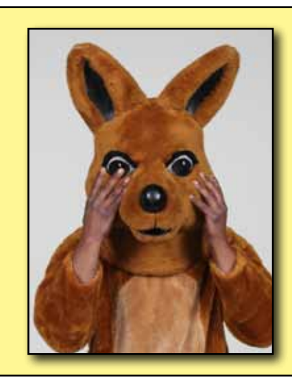
4 Put on the Head.

It can be adjusted by sliding the rear of the headgear sides in or out.