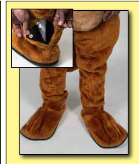
Put on the Feet. Snap closed in the back at ankle.