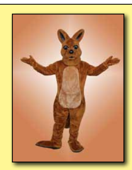
6 The Kangaroo is now ready to entertain.