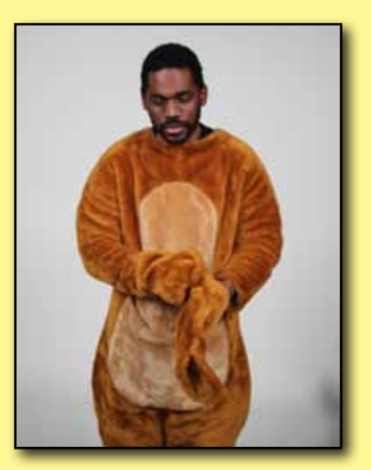
FPut on the Mitts.