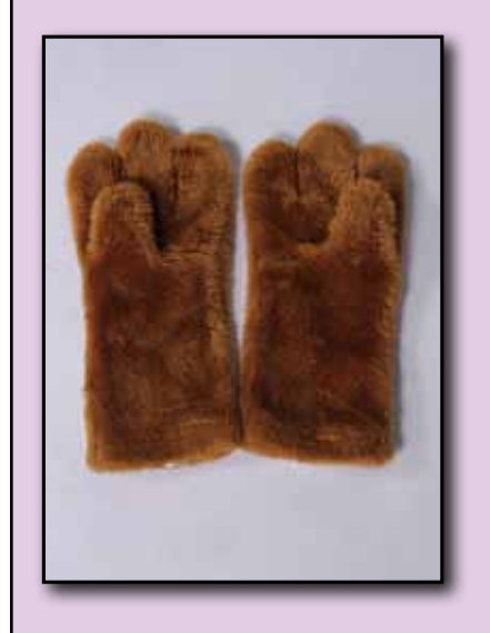
1 Pr. Mitts