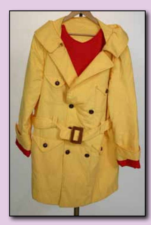
Coat w/attached Shirt