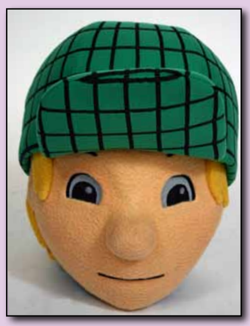
Head w/attached Hat