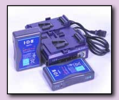
2 Endura Batteries and VL-2 Charger