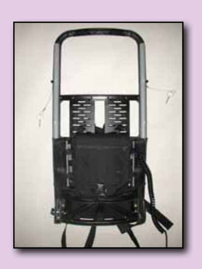
Backpack w/V-Mount Bag