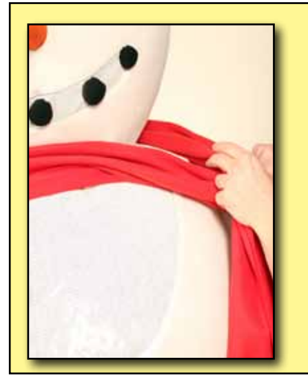
13 Put on the Scarf making sure to line up the center back of the Scarf and the center back of the Body.

Wrap around the neck and drape one end over the other on the left shoulder.