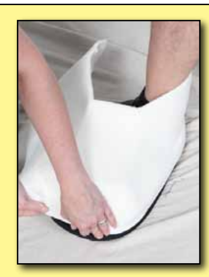
6 Attach the velcro on the Shoe Base to the velcro on the Costume, making sure to line up the center front and the center back. This should be a snug fit.