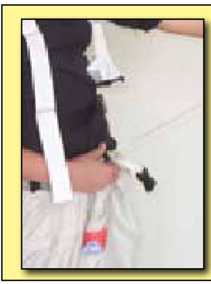
10 <sup>Once inside,</sup> pull the skirt up to your waist and tighten the drawstring around your waist. This seals the Costume and allows the Costume to inflate.