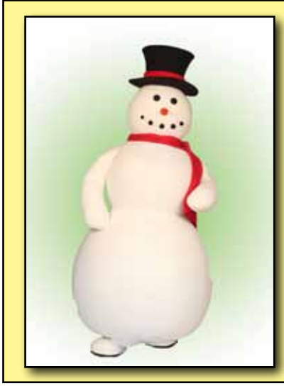
14<sup>Snowman is</sup> now ready ro entertain!

Wrap around the neck and drape one end over the other on the left shoulder.