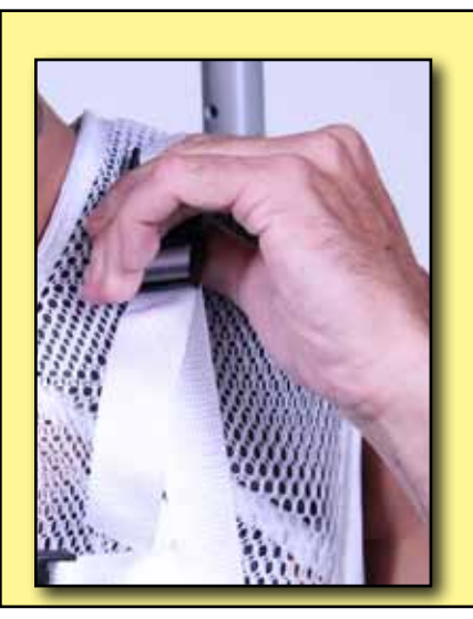
11 Clip your suspenders into the clips on your Electrical Vest.

And adjust them to achieve the appropriate height.