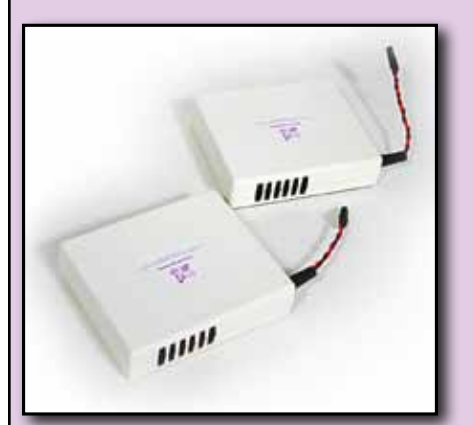
2 BSC Fans(located in the Body)