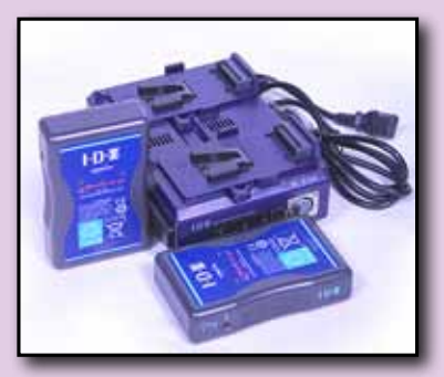
2 Endura Batteries and VL-2 Charger