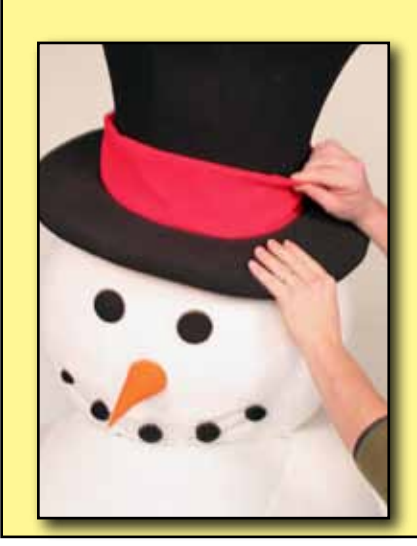
12 Adjust the Hat Brim by holding the velcro in place at the top of the Hat band and pull down on the Brim to make it taut.

And adjust them to achieve the appropriate height.