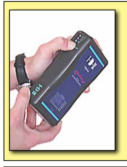
1 Make sure all Batteries are fully charged.