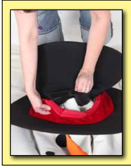
3 If the Brim is not already attached, Velcro the Hat Brim onto the Costume's Hat.