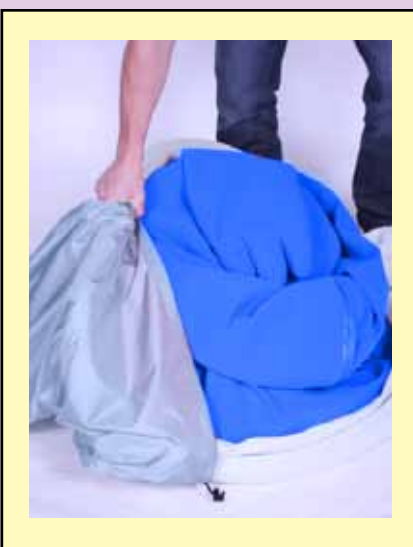
5. Place the now compact costume into the dust bag.