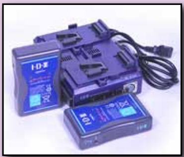
2 Endura Batteries and VL-2 Charger