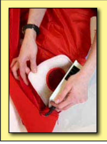
1 Make sure that the Fans are secured to the corresponding velcro patches in the Body. The vent on the Fan should point up to the top of the Costume.