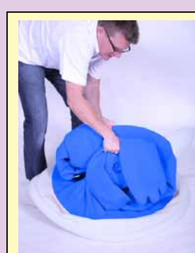
4. Twist with one hand and push with the other hand so the hoop doubles over ontop of itself like a figure eight.