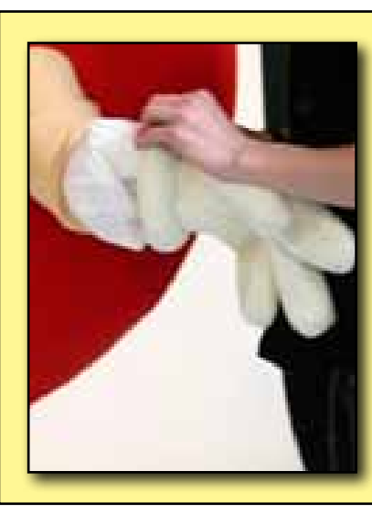
3 <sup>Put on the Mitts</sup> and snap them to the wrist of the Body.