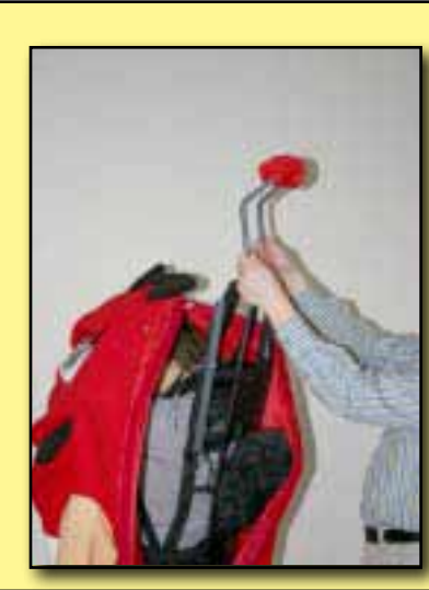
6 Velcro the Frame Extension to the "Clutchie" in the top of the Body.