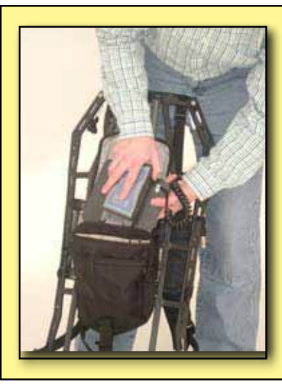
Put the Battery in the V-Mount plate and put the V-Mount plate into the pouch on the Backpack and zip it closed.