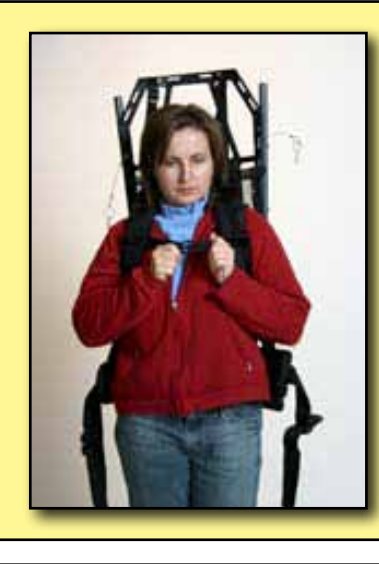
4<sup>Put on the</sup> Backpack and fasten the clips to fit securely.