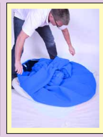
2. Tuck the legs and arms together in the center of the body.