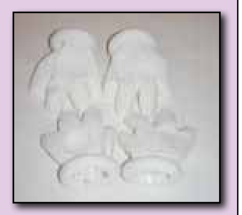
2 Pr. Mitts