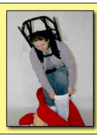
5 Step into the Body and pull the inner legs up under your knees. Pull the Body up around you.