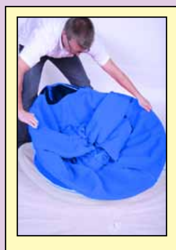
3. Grasp the edges of the hoop with an "over-under" placement of your hands.