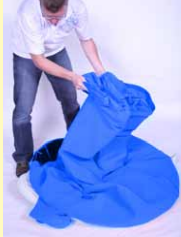
Figure Eight Storage Instructions

1. Place the character upside down on the ground and locate the legs of the character.