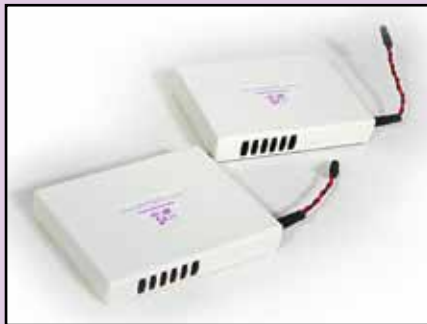
2 BSC Fans (located in the Body)