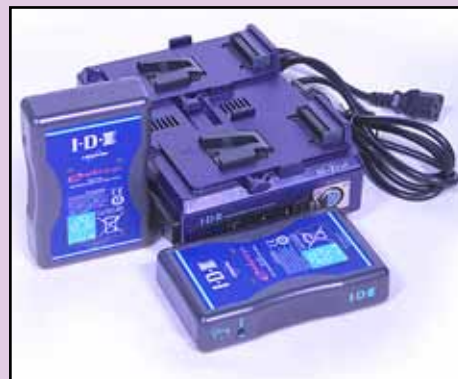
2 Endura Batteries and VL-2 Charger