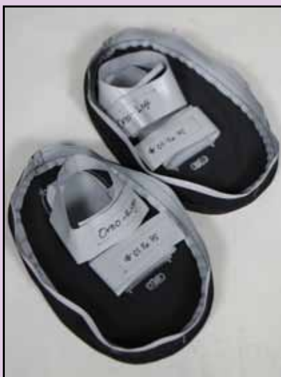
1 pr Shoe Bases