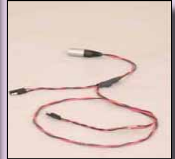
Y-Cable (located in Body)